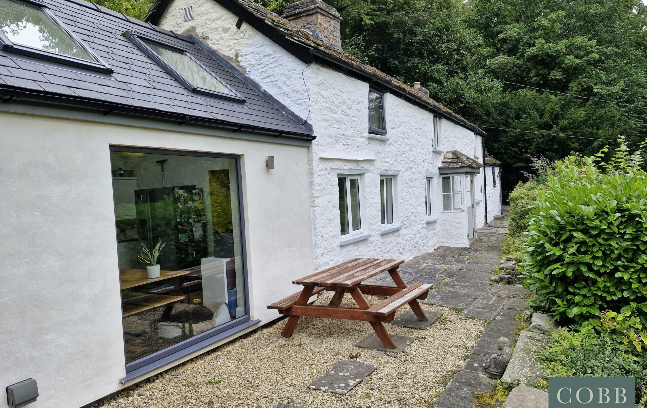
Three Ways, Cusop Dingle, Hereford, HR3 5RQ Price £665,000